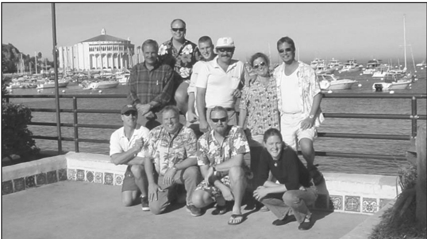
An "Away Class" held on Catalina Island, California

Please note every case is different and it is important that you read your USCG approval letter carefully to determine your requirements and/or discuss these requirements with a school administrator.