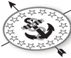
CHART YOUR COURSE WITH Maritime Institute

It is MARITIME INSTITUTE'S goal to provide a path that allows its students to obtain licensure and complete an Associate's and/or Bachelor's degree program that will enhance the individual's self-worth, education and provide upward mobility.